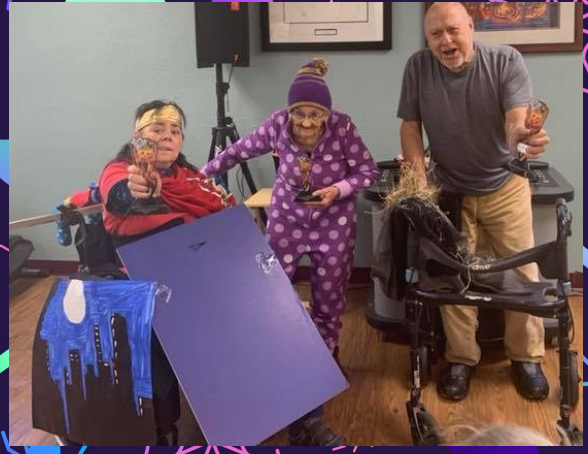
The Big Winners

The ADHC was a happening place with Halloween activities as we celebrated October birthdays, and held the annual Halloween Costume Contest! Participants got very creative with their costumes this year. We awarded our three winners with individual trophies. 1st place went to “Hay Vern”, 2nd place went to “Wonder Woman”, and 3rd place went to the “Sleepy Elf”.